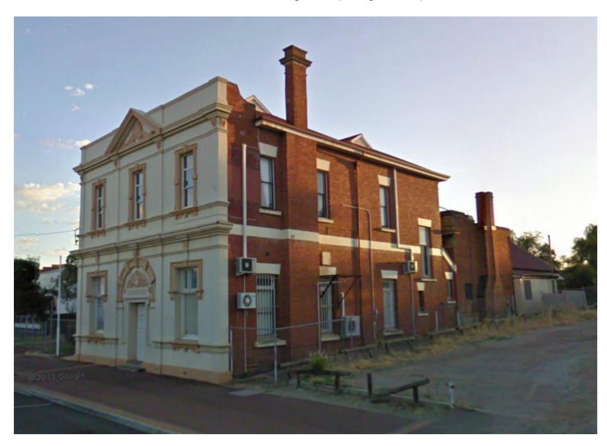
National Bank Northam (Google 2013)