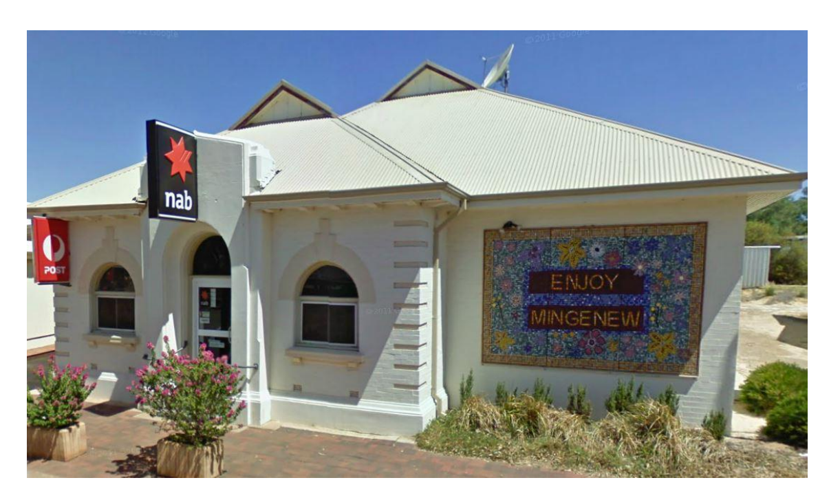
National Bank Mingenew