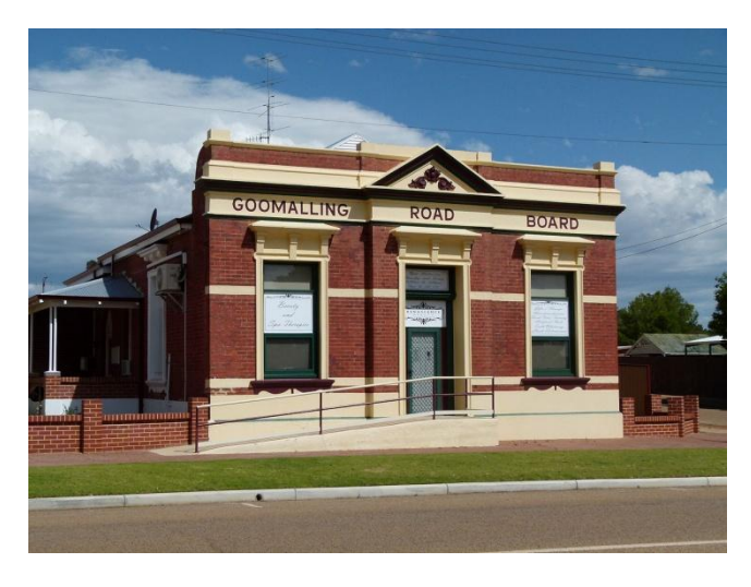
National Bank Goomalling (http://www.mingor.net/localities/goomalling.htm)